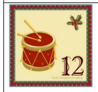
Bring the Snow Inside and play with TWELVE toys

Click Here: Northeast Ohio Family Fun has a list of all the Best Local Light <u>Displays</u>